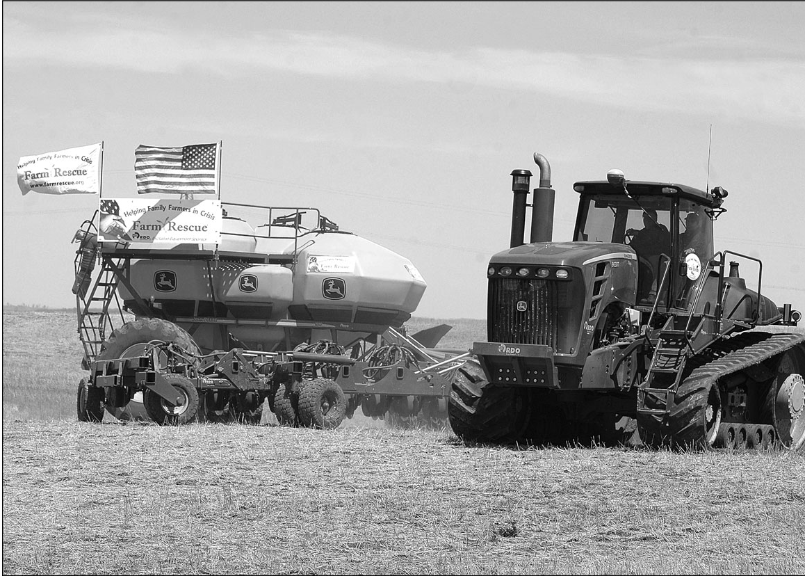
The Farm Rescue crew handles the planting of the Backman field on Wednesday afternoon in rural Wilton.